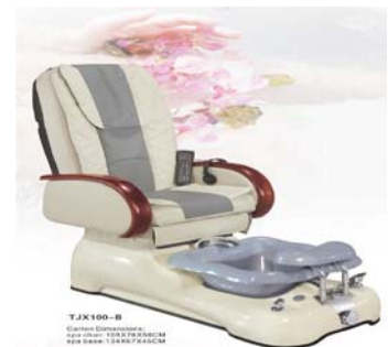
TJX100-D 1 Pip les jets Pedicure Spa