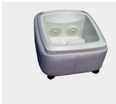
SPA-800 2 Pip les jets Pedicure SPA