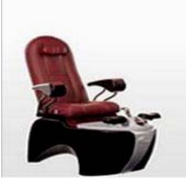
SPA-M2008L 2 Pip les jets Pedicure Spa