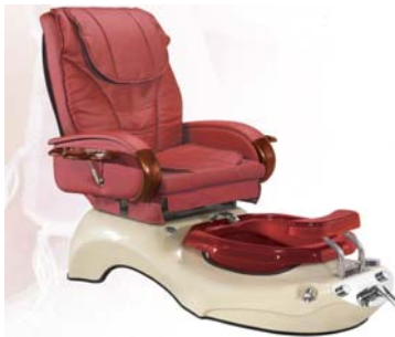
TJX2000-C 1 Pip les jet Pedicure SPA