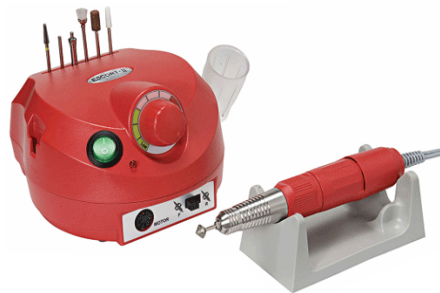
BNX-1184R 30,000 Rpm.