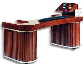
B 29" H x 18" W x 46" L