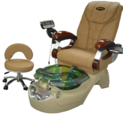
SPA-TJX2000-A 1 Pip les jet pedicure spa