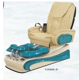
TJX600-D 1 Pip les Jet Pedicure Spa