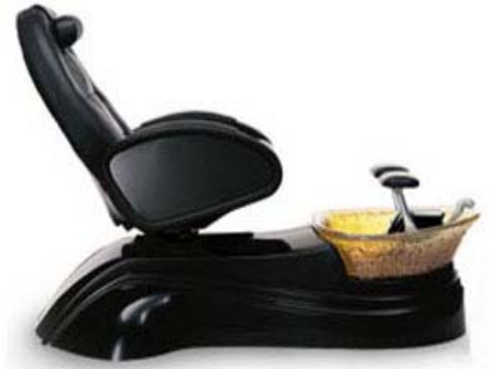
SPA-M2009L 1 Pip les jet Pedicure SPA