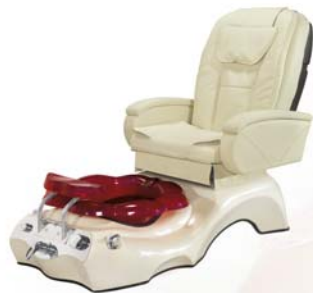
TJX4000-D 1 Pip les jet Pedicure SPA